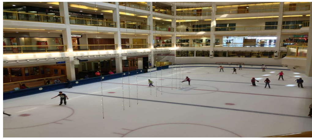
Dimond Center Mall