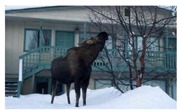
A Local Resident